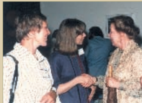
Architect Elissa Aalto (right), widow of Alvar Aalto visited Chicago in 1982 and FACC held a dinner in her honor.